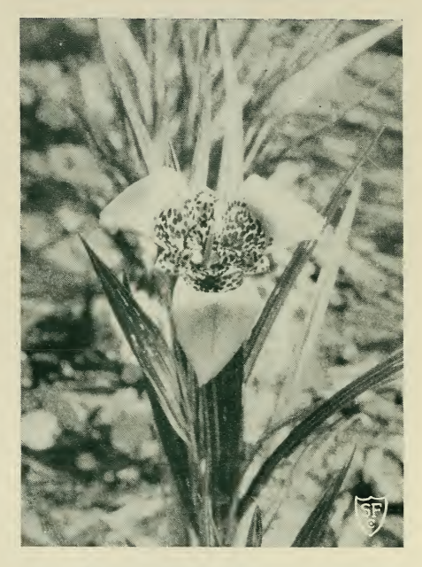
The Mexican Flame Flower or Tigridia

OF SENSATIONAL flowers for rich and unique coloring, this easily grown bulbous plant is a marvel that no garden lover should be without. It will grow as readily as a common gladiolus bulb but loves rich loose soil with plenty of water during the hot weather and sunny situation in the garden suits it best. Bulbs may be set out during April, May and June. Take them in before frost in late fall or early winter and store them the same as gladiolus bulbs. Price 4 bulbs for $1.00, dozen $2.50, postpaid. Flowers continuously from June till frost.